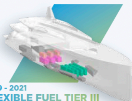
2019 - 2021 FLEXIBLE FUEL TIER III

A fuel flexible modular engine room. Ready for future energy transition with the possibility to be carbon neutral in 2030.