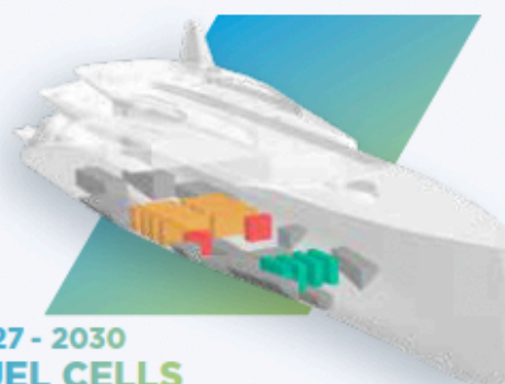
2027 - 2030 FUEL CELLS

ICE = Internal Combustion Engine HVO = Hydrotreated Vegetable Oil MEOH = Methanol FC = Fuel Cell