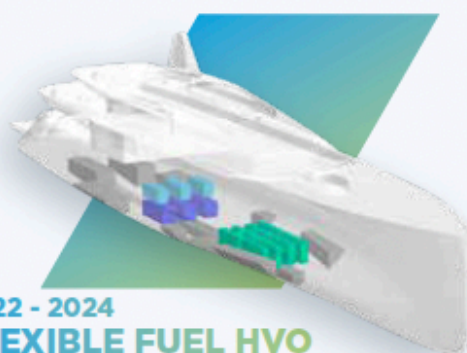
2022 - 2024 FLEXIBLE FUEL HVO